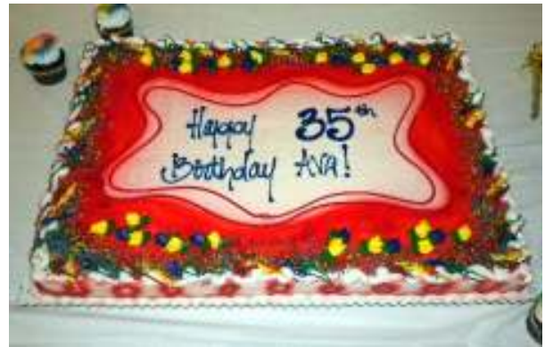
The large 35th Convention Birthday Cake